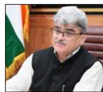
Department, Commissioner, Secretary, Planning, Information Technology; Director, SKIMS; Principal, Government Medical College, Srinagar/Jammu besides other