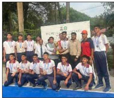
ing schools, Sainik School Nagrota defeated Sainik School Kunjpara

Nagrota, May, 12: Sainik School Nagrota once again brought laurels to the Union Territory of Jammu & Kashmir by delivering an outstanding performance at the prestigious IPSC Basketball Championship 2026 (U-17 Boys) held from 08 May to 10 May 2026 at Pestle Weed School, Dehradun. The championship witnessed participation from 21 reputed schools from across the country, making the tournament highly competitive and challenging. Displaying exceptional teamwork, discipline, determination and sportsmanship, the cadets of Sainik School Nagrota secured the Overall Second Position and clinched the coveted Runners-up Trophy. The team showcased remarkable consistency throughout the tournament with convincing victories against some of the top participat-